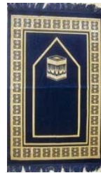
Item 0380 Navy Blue

◀ Dark Green and Tan Prayer Rug with Mihrab (Soft Velvet) 27" x 47" SCU: hrr29 Price: $11.50