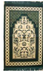
Item 0388 Olive Green