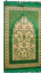
Item 0384 Green