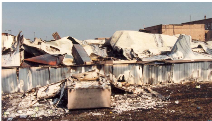
The modulares that had been burned to the ground.