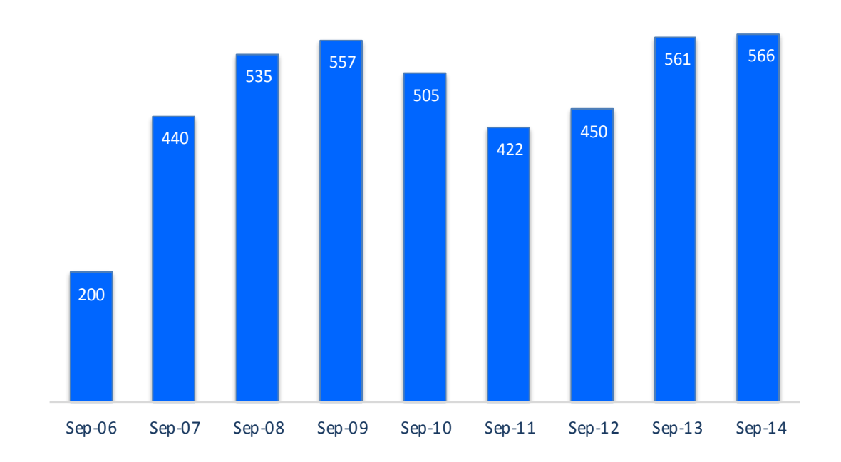
Figure 2: SIP Admissions as Percent of Eligible by County May 2005 through September 2014